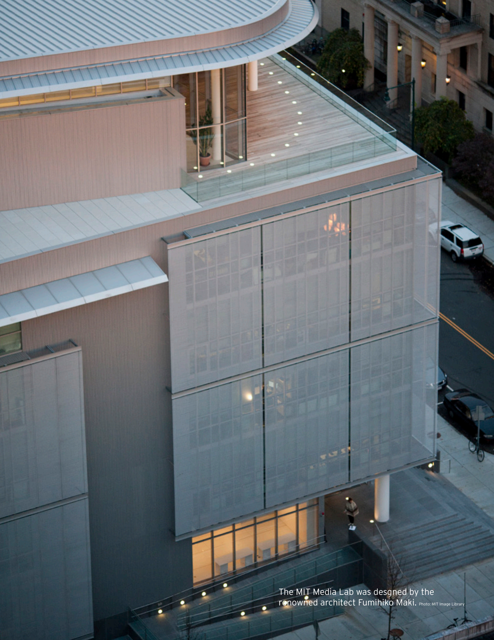
The MIT Media Lab was designed by the renowned architect Fumihiko Maki.